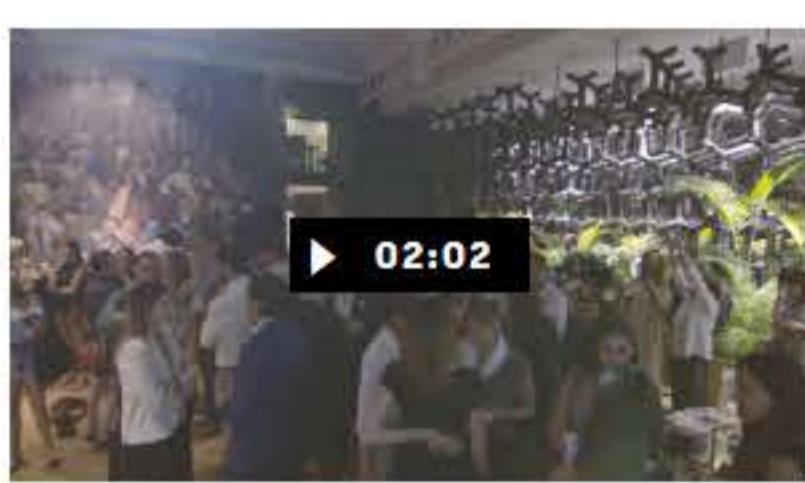
IQOS Master Style: the event and the portfolio review in Milan