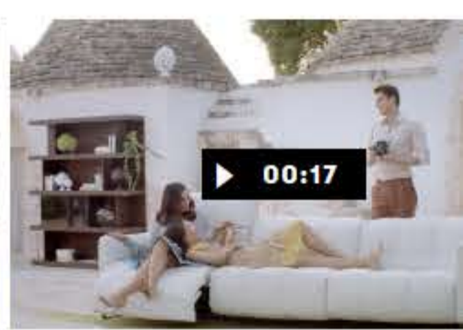
Natuzzi Italia #worldofharmony